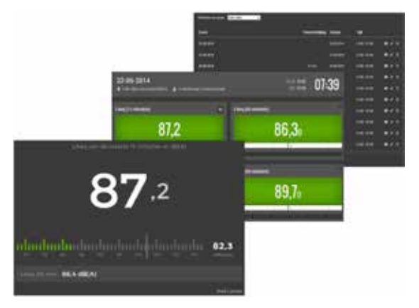
Music event views: easy, configurable, responsive

All raw measurement data is stored in the platform during the contract period and is available for historic analysis, reporting and traceability. Measurement location, time and measurement station and its calibration history, is stored for every measurement sample. Audio data is stored for three months. All data is stored in secure, certified and redundant data centers.