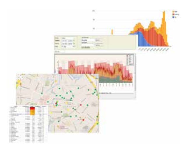
Noise specialists; analysis, trends, statistics, correlations