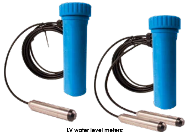
LV water level meters; available for use with 1 or 2 sensors